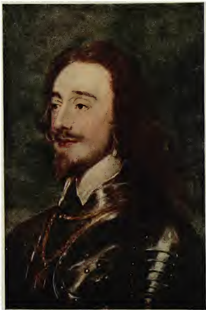
Charles the First Van Dyck